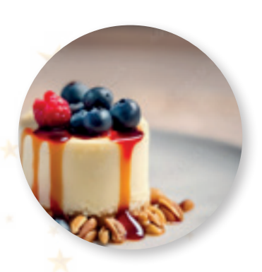
*Courses also available individually