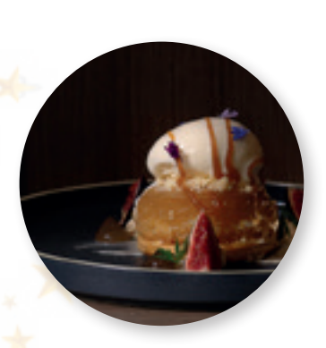
*Courses also available individually